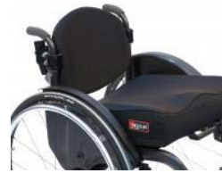
Vigour Lo Back support

Paediatric, kids and adult seating technology ranges can grow and adapt to the users' needs as they experience changing needs. Users only need order what they need and can add/remove components as their condition changes.