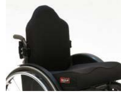
Vigour Mid Back Support

movement. Being angle-adjustable and light-weight, with additional positioning kits for shaping as required, these supports offer a versatile positioning and support to meet individual need.