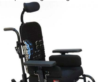
Spex Tessellated Positioning Kit on Vigour High backrest shell

The tessellated positioning kit can sit behind the Spex upholstery to allow for shaping to the user to optimise support, without compromising on comfort and weight. It allows customisations and adjustment.