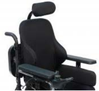
Spex Mantaray Backrest

It is lightweight and provides greater support than the Vigour range. Additional shaping can be provided with positioning kits if required and if greater support is needed for the head, a head support can be fitted with ease.