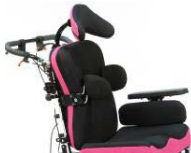
Spex Contoured Head Support

The Spex head support range provides support in several different positions to provide optimal head alignment to encourage interaction, manage fatigue and pain and promote continued engagement in activities.