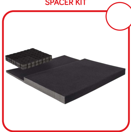
ISCHIAL CONTOUR CUSHION SPACER KIT

Raises cushion for extra long leg lengths, or as a base for attaching contouring support wedges.