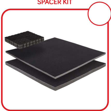
CUSHION SPACER KIT