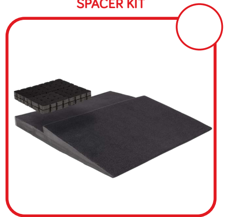
HIP FLEXION CONTOUR SPACER KIT

Helps to prevent posterior pelvic sliding.