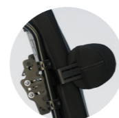
Lateral Trunk Supports