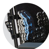
Tessellated Positioning Kit